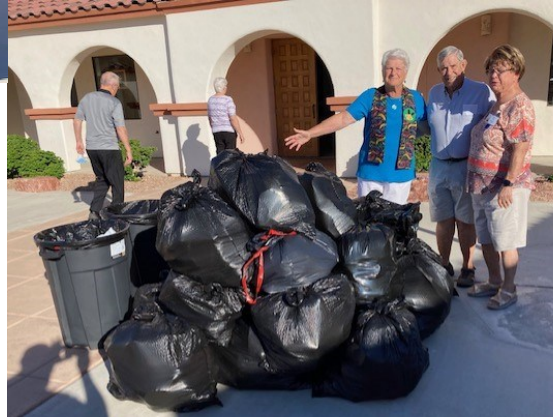
2000 Shoes for Crossroad Mission