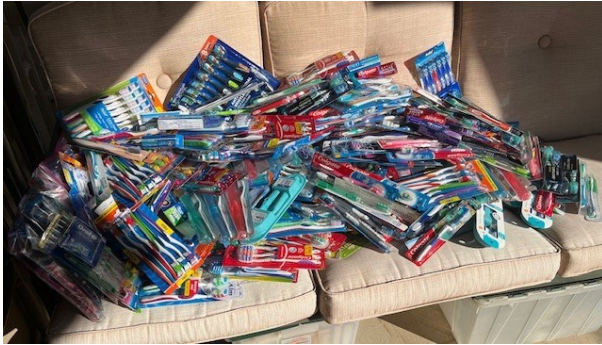
550 Toothbrushes Collected for Crossroads