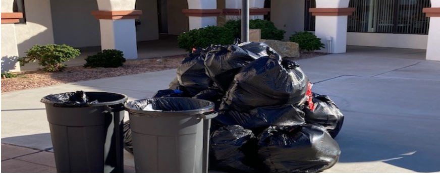
800 pair of Underwear for Crossroads