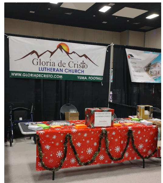
2023 Welcome Back Bash